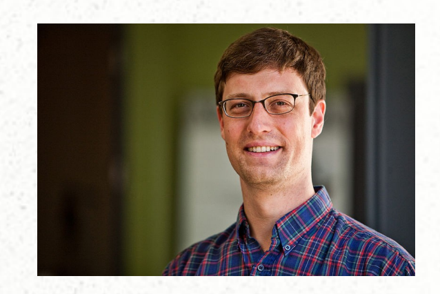
Pete Forsyth Wiki Strategies